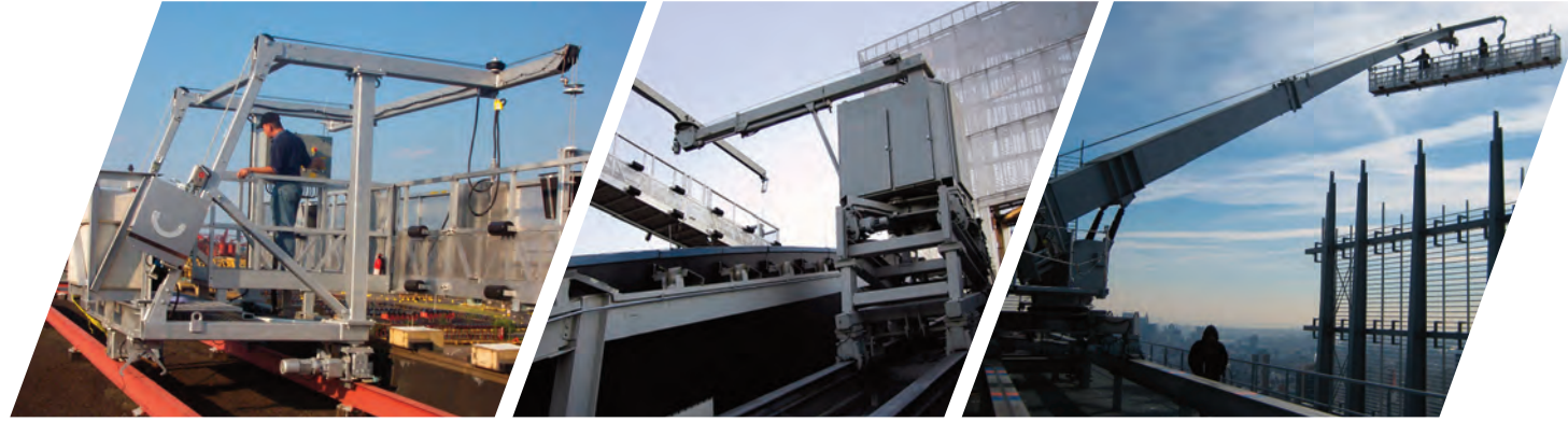
Stick Built - Retrofit Transfer Shunt Carriage Luffing