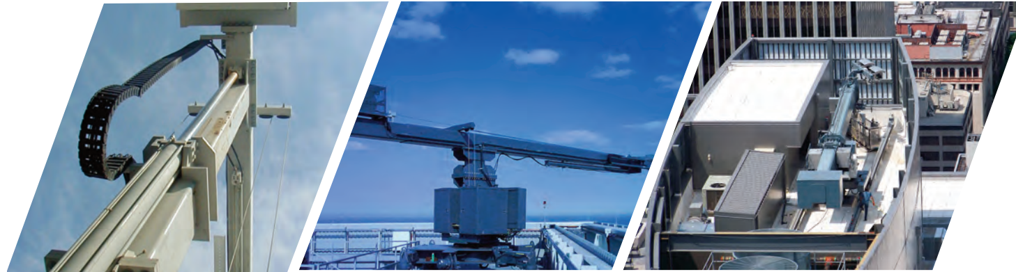
Telescoping Mast Material Hoist at Boom Tip Parked Position