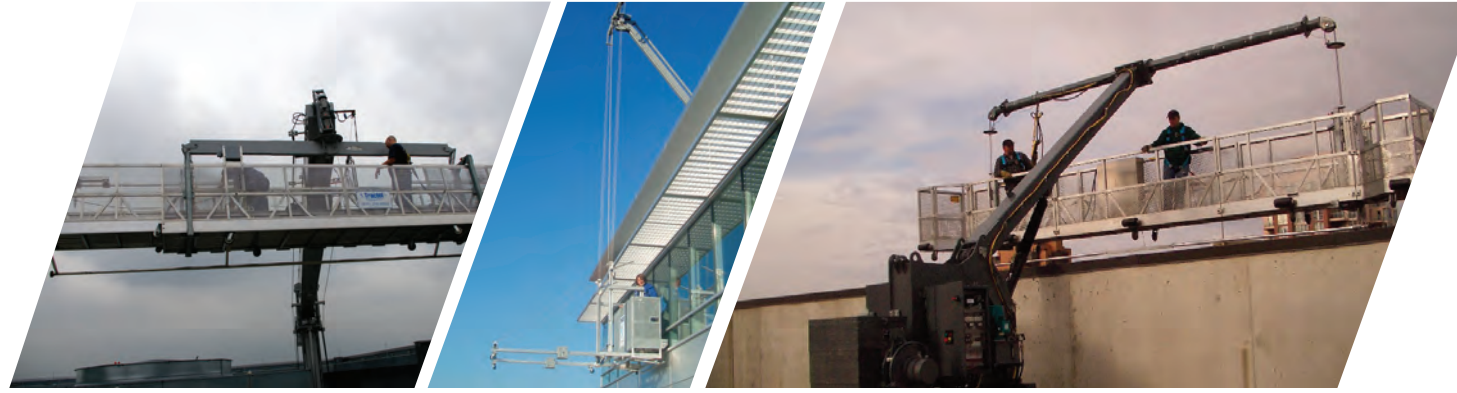
tracomod® Extendable Platform Articulating Platform Track Mounted Retrofit