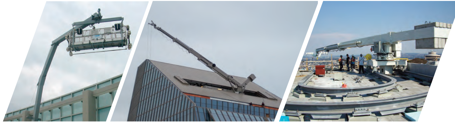
BMU with Self-Powered Platform Luffing and Telescoping Mast Track Mounted